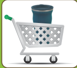
1) Buy the Sof-t