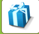
4) Win cool prizes

Problem: Consumers look for ways to identify with brands and customize products and information to fit their personal lifestyle.