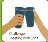
Challenge: Toasting with Sof-t 2) Complete a Grip Tour challenge