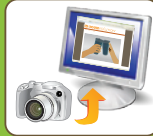
3) Upload your challenge photo at www.liquid-solutions.com